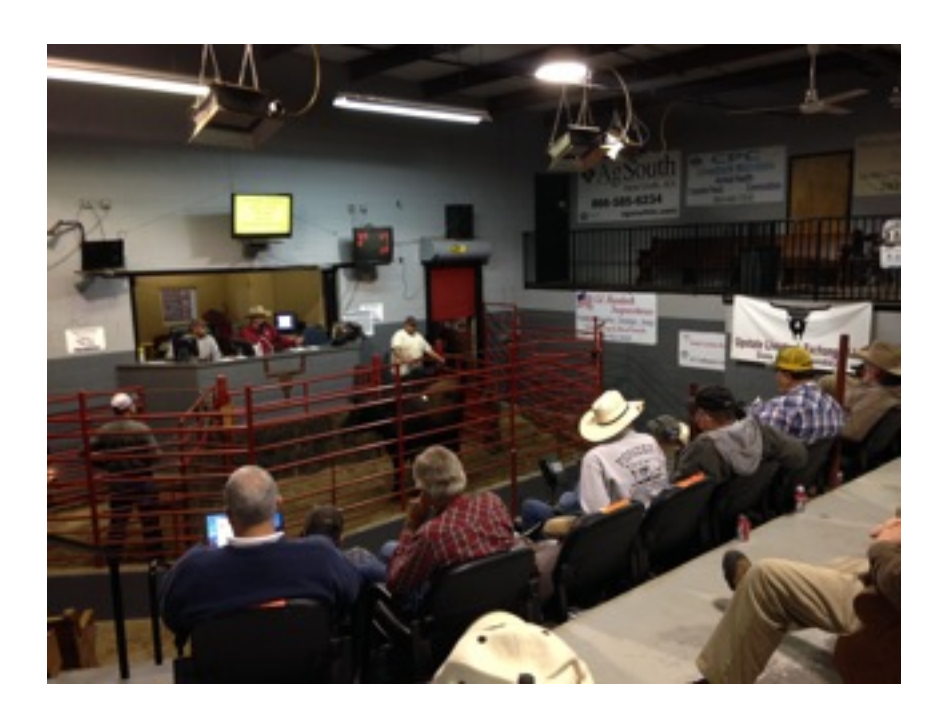
Selling steers at auction