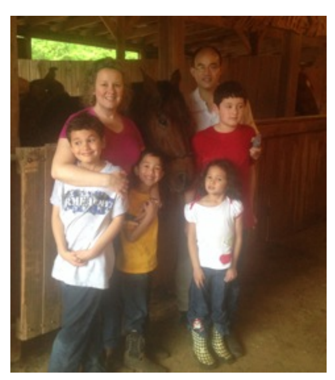
Doctor from the Philippines and family