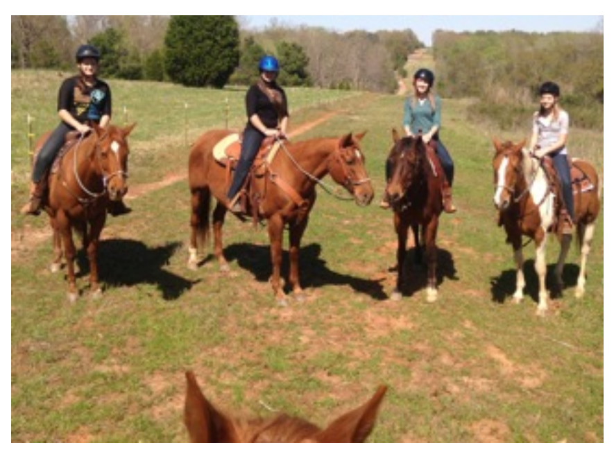
Russian seventeen year olds