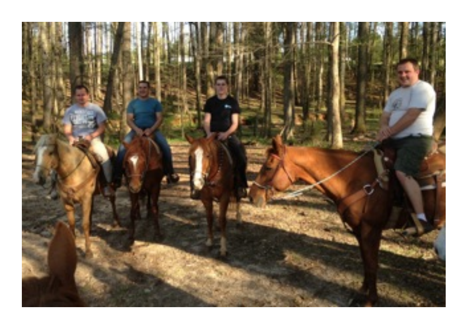
Ukraine young business men