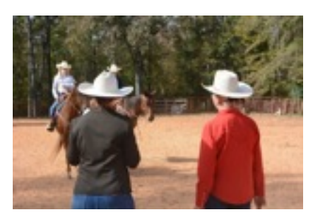
Horse Show Judging