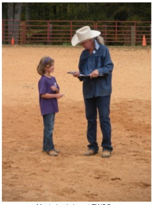
Mentoring is key at TWQC

Please pray that we will have wisdom and stamina. Camp CoBeAc has asked us to come help them with starting a horsemanship part to their summer camp program. We need to be able to have the time and personnel to run things when we are gone.