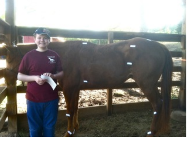
Trail rides are a favorite