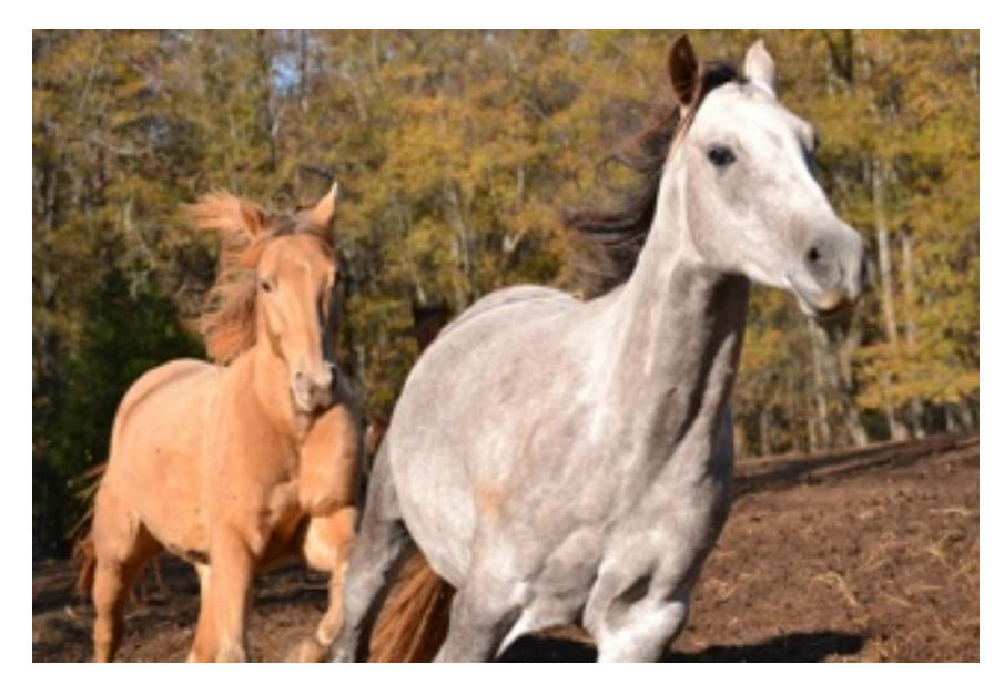
YELLOWSTONE & GLACIER RUNNING FOR THE BARN

TW Quarter Circle Ranch Ministries Curt (864) 979-1552, Bev (864) 430-9526, Training horses and riders The Montana Connection <a href="https://www.twqc.org">www.twqc.org</a>