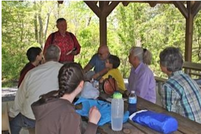
Lunch during a trail ride at DuPont State Forest