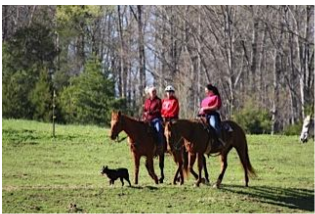
Trail riding at our Fountain Inn facility