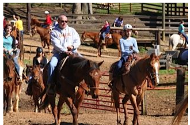
A birthday party heading out on the trail