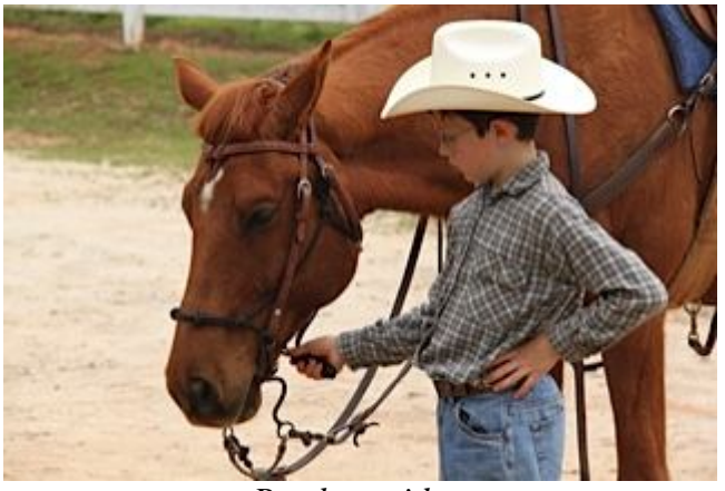
Ready to ride