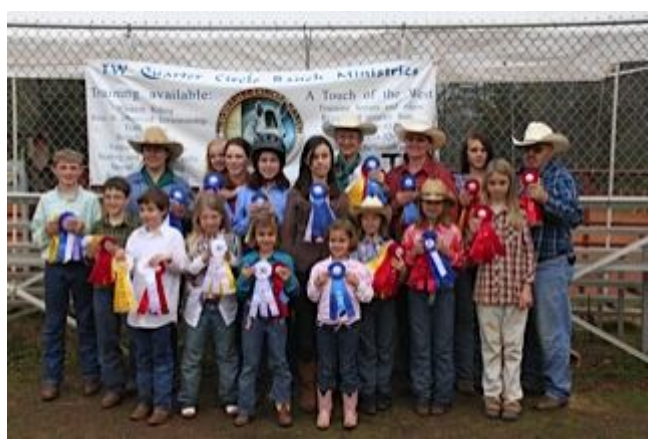
Ribbon winners at the Spring Show Circuit