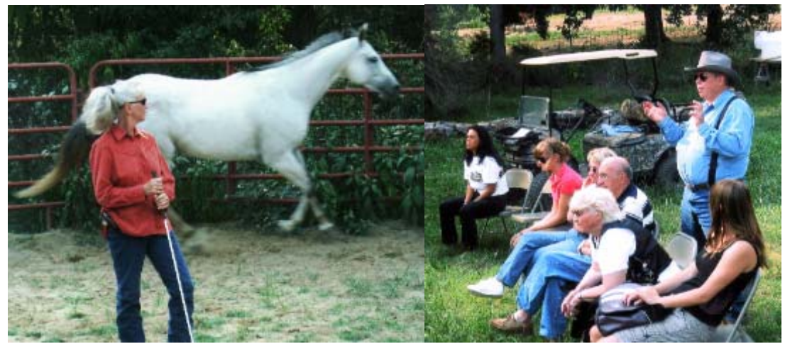
Special Groups, Birthdays, and Home School Western Experience

Using our horse Willow to demonstrate the nature of the horse and his relationship with man, and then relating it to man and our relationship with God, continues to be an effective tool. We have had many opportunities to minister in this way recently. It's such a tremendous object lesson that reaches the hearts of young and old.